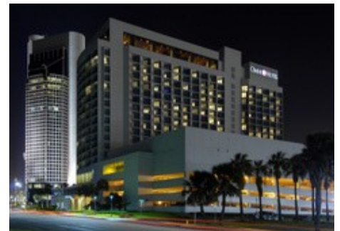
Omni Hotel Corpus Christi Bayfront Tower